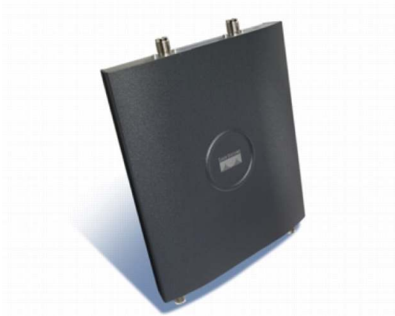
Figure 1. Cisco Aironet 1240G Access Point

The Cisco Aironet 1240G Series is a component of the Cisco Unified Wireless Network, a comprehensive solution that delivers an integrated, end-to-end wired and wireless network. Using the radio and network management features of the Cisco Unified Wireless Network for simplified deployment, the Cisco Aironet 1240G Series extends the security, scalability, reliability, ease of deployment, and manageability available in wired networks to the wireless LAN (WLAN).